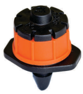
Shrubbler® 360° PC Barb 4 mm