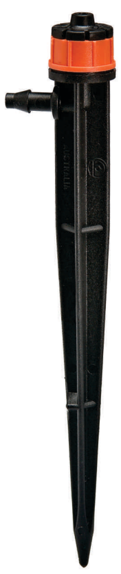
Shrubbler® 360° PC Spike Inlet 4 mm