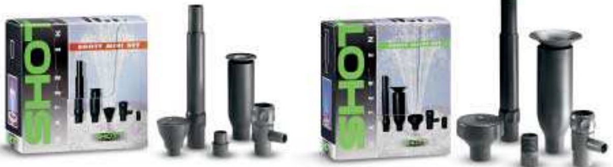
Mini fountain sets